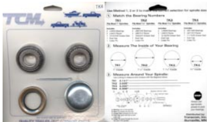
Ready for display at your shop! (Front & back shown)